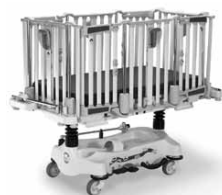
190 Hydraulic Model