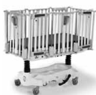
190 Fixed Height Model

3800 E. Centre Ave. Portage, MI 49002 t: 269 329 2100 f: 269 329 2311 toll free: 800 787 9537