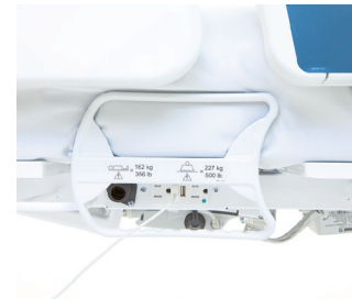
USB power outlets