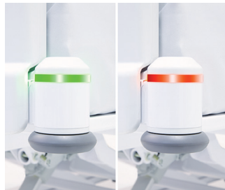
Bed exit side view lights