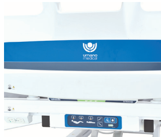
Back-up control on the frame