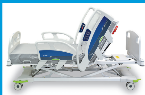
Boostless™ backrest system for improved patient comfort during bed activation