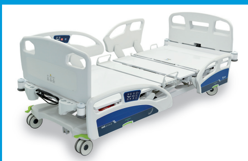
Open architecture for ease of cleaning and simple installation of mattress