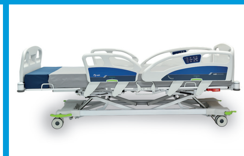
Optional integrated bed extender for more flexibility