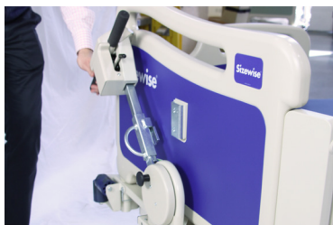
3. Rotate Unit to the left