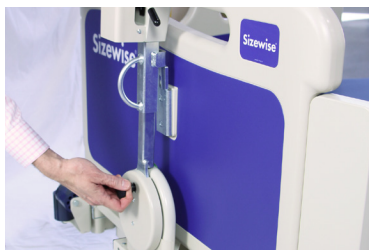
1. Pull black knob