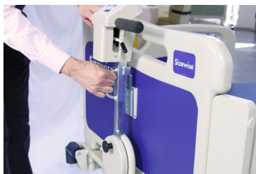
2. Lift silver handle