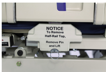
Install lock pin

Removal: pull out pin and lift rail straight up