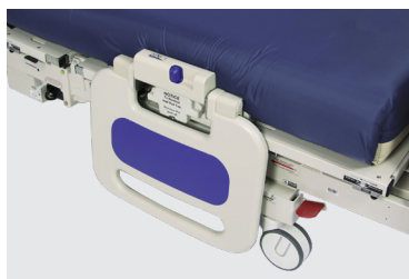
Position side rail

To adjust: squeeze knobs while placing rail in desired position