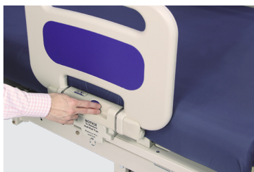
Push to adjust rail