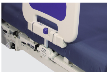
Slide rail into top deck