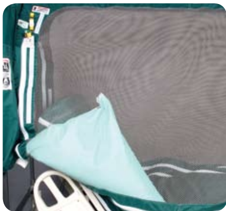
Fig. 1. Filler Cushions with head of bed in the up position