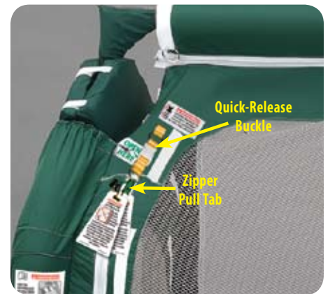
Fig. 2. Quick-Release Buckle with zipper secured