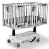
190 Fixed Height Model