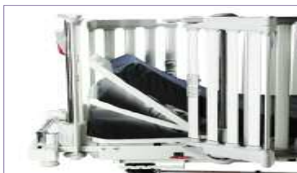
Retracting backrest reduces the gap against the siderail while swing-open access doors allow easy patient care.