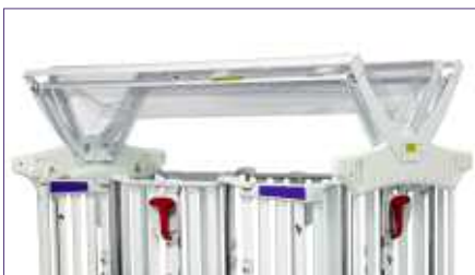
Optional protective top equipped with intermediate support position on each side.

Responsible pediatric care demands a stretcher specifically designed around safety, access and ease of use. The Cub pediatric crib supports safe and efficient care practices while the warm, friendly appearance cultivates a healing environment for small children and their families.