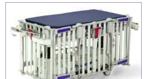
Lowered siderails provide unobstructed access.