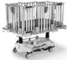
190 Hydraulic Model